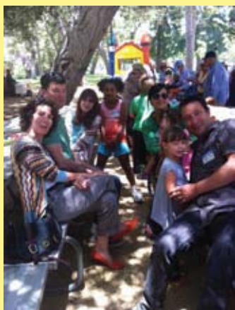
Lots of family participation