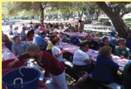
Estimates of over 100 in attendance